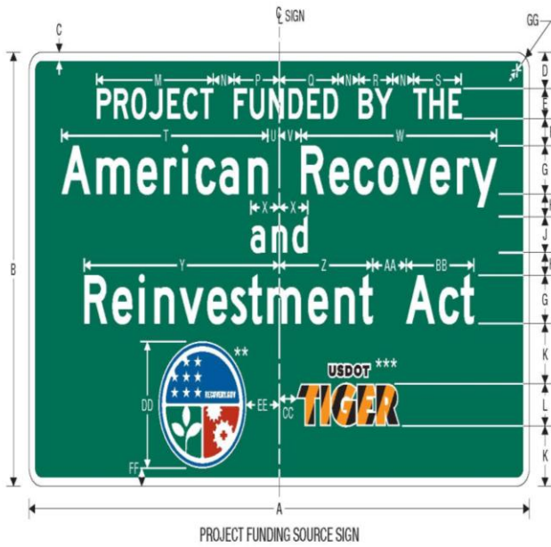
PROJECT FUNDING SOURCE SIGN

NOTE: SIGN SHALL NOT BE INSTALLED WITHOUT PROJECT FUNDING SOURCE PLAQUE (SEE SHEET 3).